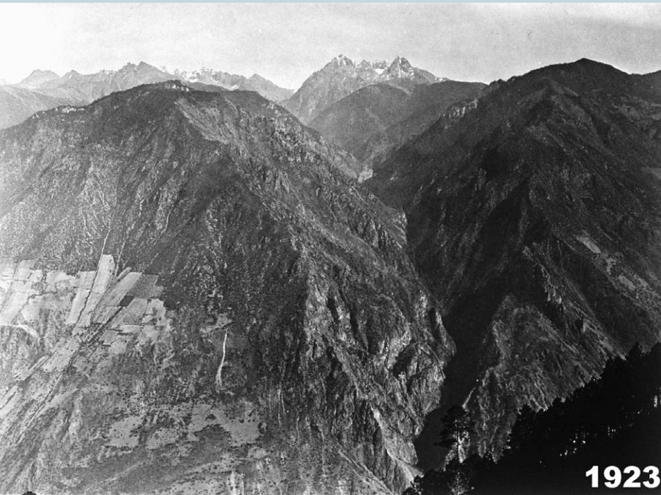
FIGURES 2A AND 2B Mountainside above Chalitong village, Deqin County. Vertical streaks on the left side of the images, faint in 1923 and obvious in 2003, are trails used to slide logs down to the village. Their presence in both images indicates that forests have been under continuous use for 80 years, yet cover has remained stable. (Original photograph by Joseph Rock/National Geographic Image Collection, 19 November 1923; modern photograph by Robert Moseley/The Nature Conservancy, 24 October 2003)