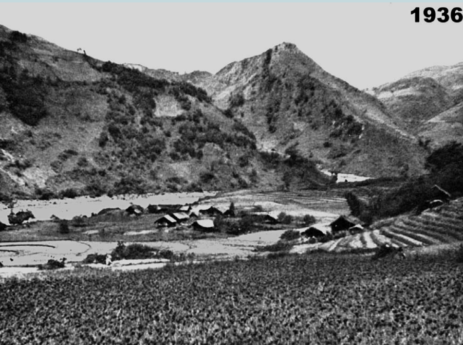
FIGURES 4A AND 4B Hillsides near Lazhidi village, Fugong County. Many crop fields and pastures in 1936 are now forested. (Original photograph by André Guibaut/Annales de Géographie, summer/autumn 1936; modern photograph by Robert Moseley/The Nature Conservancy, 4 November 2003)